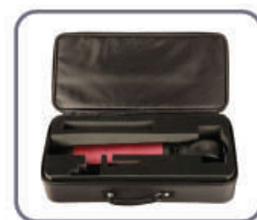
Prisma HD in convenient carrying case