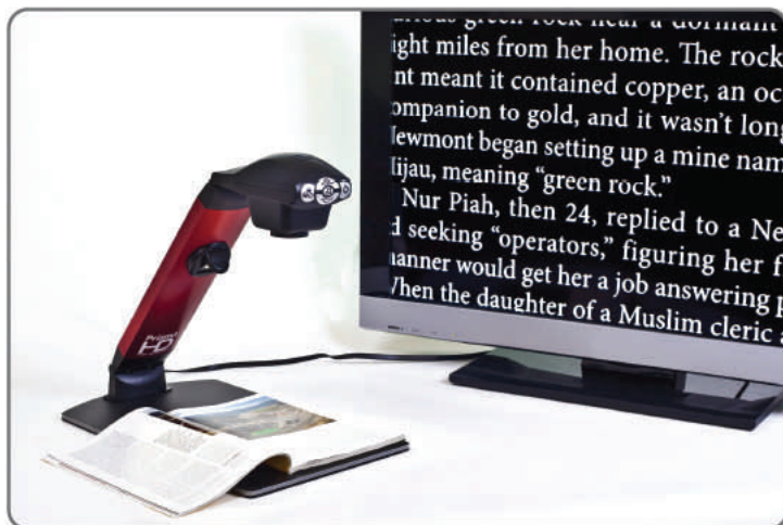
Prisma HD video magnifier in use