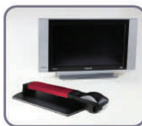
Prisma HD folded down