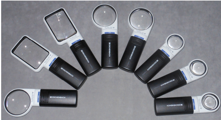
New Mobilux LED Group

The Mobilux product family has a new design with many beneficial features!