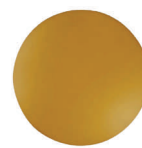
Darkest (85% brown)