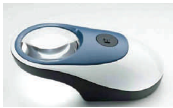
Offer expires December 31, 2011

Now available in 3 levels of magnification!