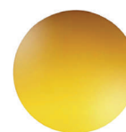
Gradient (50% - 15% brown)