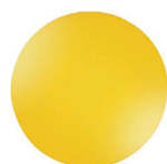
Light (15% brown)

Most eyewear that blocks 470nm light and less is bright yellow which may minimize its acceptance by users. To alleviate this problem, Eschenbach's Wellness Protect Eyewear includes the following 5 tints: a light 15% brown, a dark 65% brown, a new polarized darker 75% brown, a darkest 85% brown, or a gradient that is 50% brown at the top of the lens and decreases to 15% at the bottom of the lens. These tints give users a choice as to how much overall light they want to have blocked, and the gradient option provides the ability to block more light looking straight ahead, and less light when looking down.