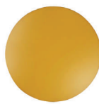
Dark (65% brown)