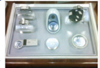
New Stand Magnifier Tray