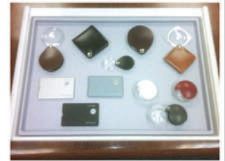
New Folding Pocket Magnifier Tray