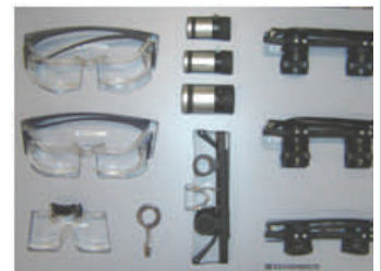
New Telescope Tray

Experienced low vision practitioners know that having a comprehensive Low Vision diagnostic assortment is essential to meet the diverse needs and goals of visually impaired patients and provide successful outcomes.