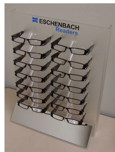
Display is free with purchase of 14 LightSpecs