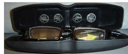
Protective case with 4 extra batteries included