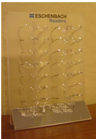
Rimless Reader Display

And since they are offered in 7 different magnifications (from 1D to 4D in 0.5D increments), you will be able to satisfy a broad range of patient's needs, especially those who require the 4D power, a magnification that is not readily available from other reader companies.