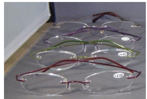
Oval style frames

A point of purchase counter-top display fits 14 pairs of readers.