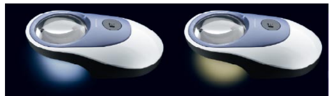
Cool blue Illumination